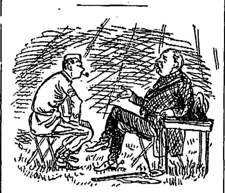
THE BATTLE OF BATOCHE.

To musicians bibulously inclined: Why should you, when taking your rests, always do so before a bar? Is it because that is your drinking time, four measures to one dead-beat?