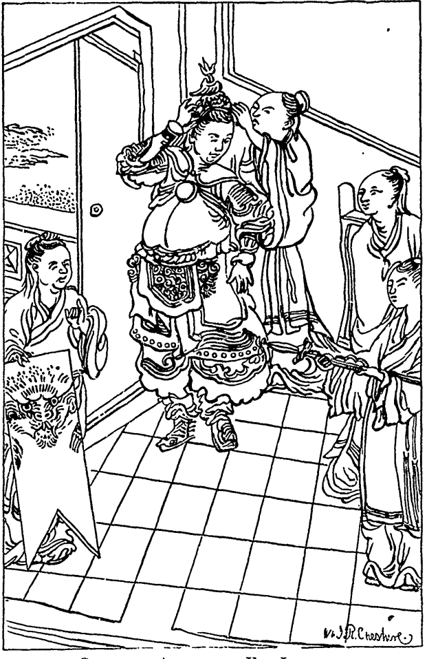
CHRISTIAN ARMED FOR HIS JOURNEY.

AN OLD FRIEND IN A NEW DRESS. HIS picture, will, most likely, puzzle you, unless the bundle fastened on the back of one of the men should help you to guess the meaning of it. That poor fellow with the burden is the pilgrim, Christian, and his companion is the good Evangelist, who "gave him a parchment roll, and there was written within, 'Flee from the wrath to come.' (Matt. iii. 7.) The man, therefore, read it, and looking upon Evangelist very carefully said, 'Whither must I fly?' There, said Evangelist, pointing with his finger over a very wide field. Do you see yonder wicket-gate? (Matt. vii. 13, 14.) The man said, No. Then said the other, Do you see yonder shining light? (Ps. cxix. 05; 2 Pet. 1. 19.) He said, I think I do. by the way."