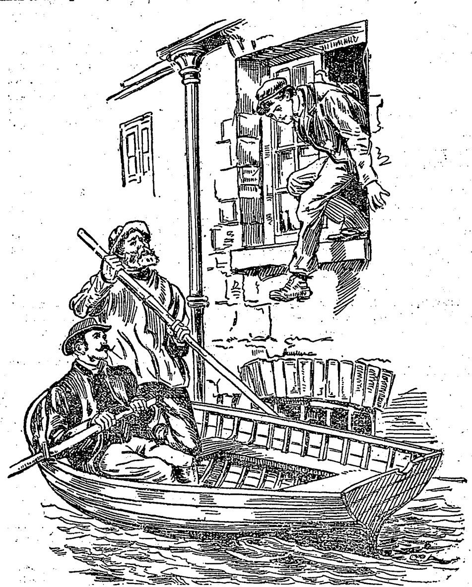
COME, JACK! JUMP IN!

'Well, sir, the flood soon passed away. There were no lives lost, and only one or two old houses came down, that were really not fit to live in; but we all had a fright, I can tell you. But it's never likely to happen again; for the danger roused the authorities, and the whole district has been drained, but those of us who were in it are not likely to forget it.'