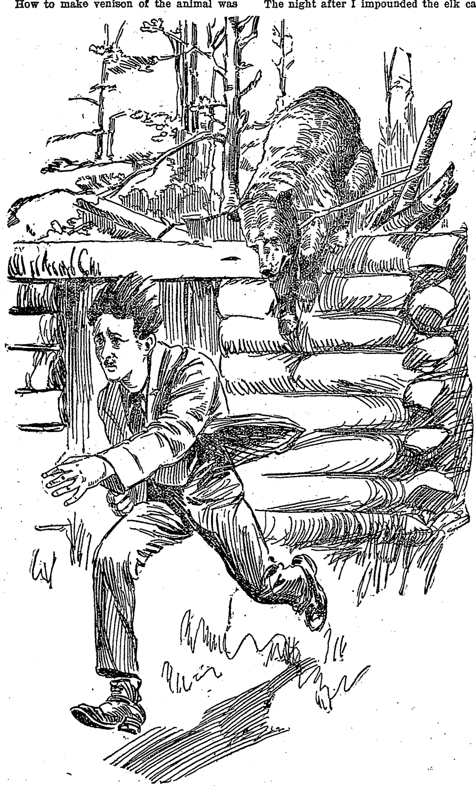
I DIDN'T STOP TO HOBBLE,

The night after I impounded the elk call