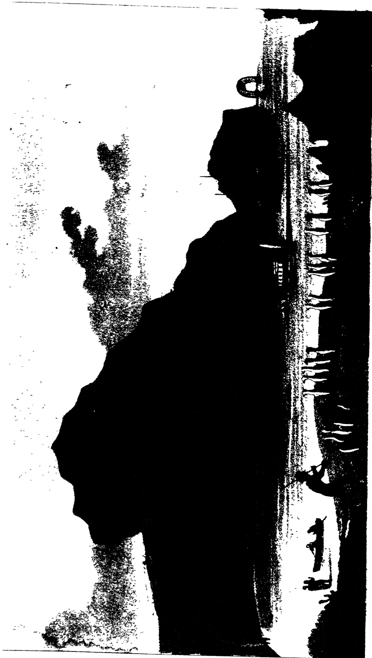
187. View of Church in 'The Day' (The Day of the Lord)