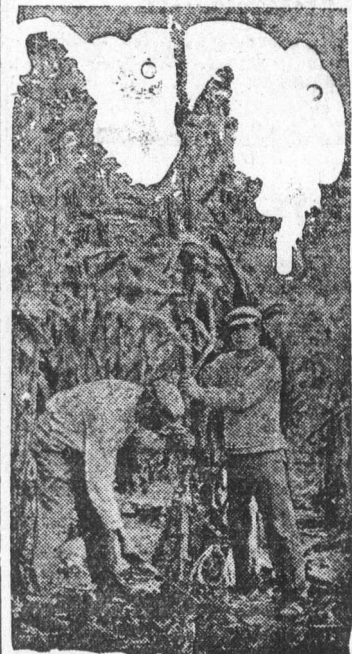
CUTTING CORN FOR SILAGE.

The proper time for cutting corn is when the majority of the ears are in the "glazed stage." If cut for silage at an earlier period it contains such a