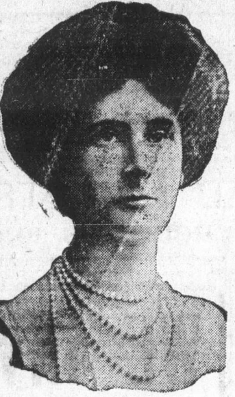
DUCHESS OF DEVONSHIRE.

The Duke and Duchess of Devonshire are likely to prove a great success in Canada when the duke takes the place of the Duke of Connaught as governor general. As for the duchess, she will be welcomed to Ottawa by hundreds of friends and acquaintances who recall the years of her girlhood, which she spent there as Lady Evelyn.