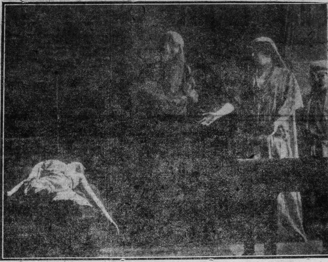
ELISHA RESTORING TO LIFE THE SHUNAMITE'S SON. SCENE IN PART 2 OF "CREATION" FILM.

Grand Opening, BRITISH THEATRE, FRIDAY, MAY 5th, at 3 and 8 o'clock P.M.