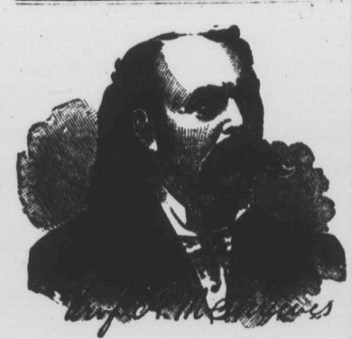
Trade Mark Registered. ANOTHER GREAT BOOM IN WINNIPEG.

whole system. Cut this out and take it to your Druggist and get a 10 cent Sample, or a large bottle for 75 cents, and tell your neighbor about it.