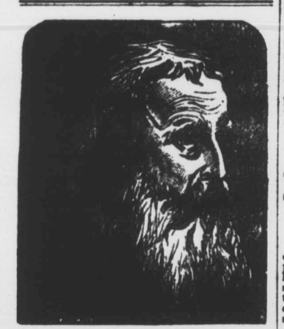
ZOPESA. (FROM BRAZIL.)

The New Compound, its wonderful affinity to the Digestive Apparatus and the Liver, increasing the dissolving juices, relieving almost instantly the dreadful results of Dyspepsia, Indigesticn, and the TORPID LIVER, makes Zoness an every day necessity in Zopesa an every day necessity in