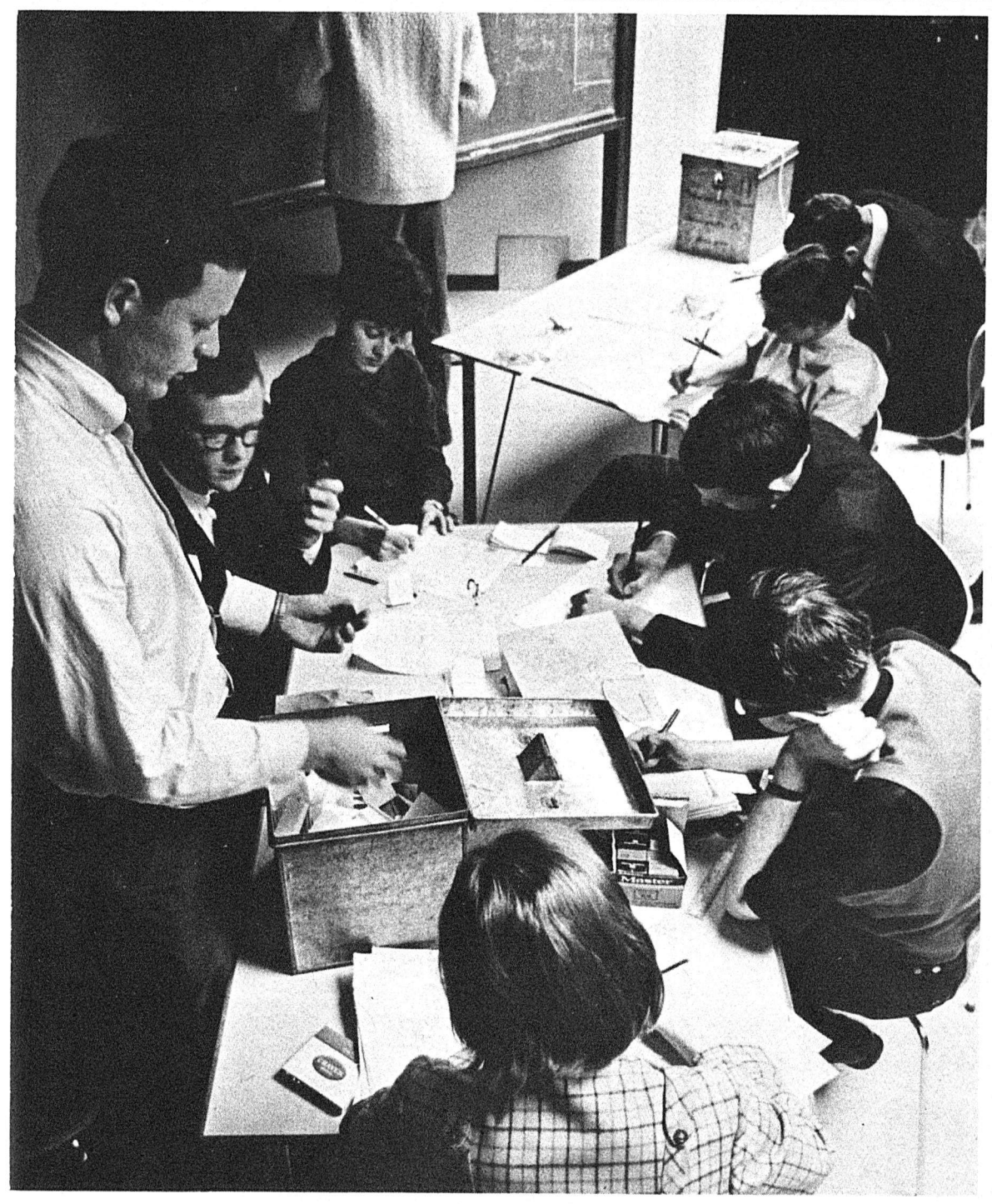
ONE, TWO, THREE, FIVE, SIX, EIGHT .

... counting the model parliament ballots