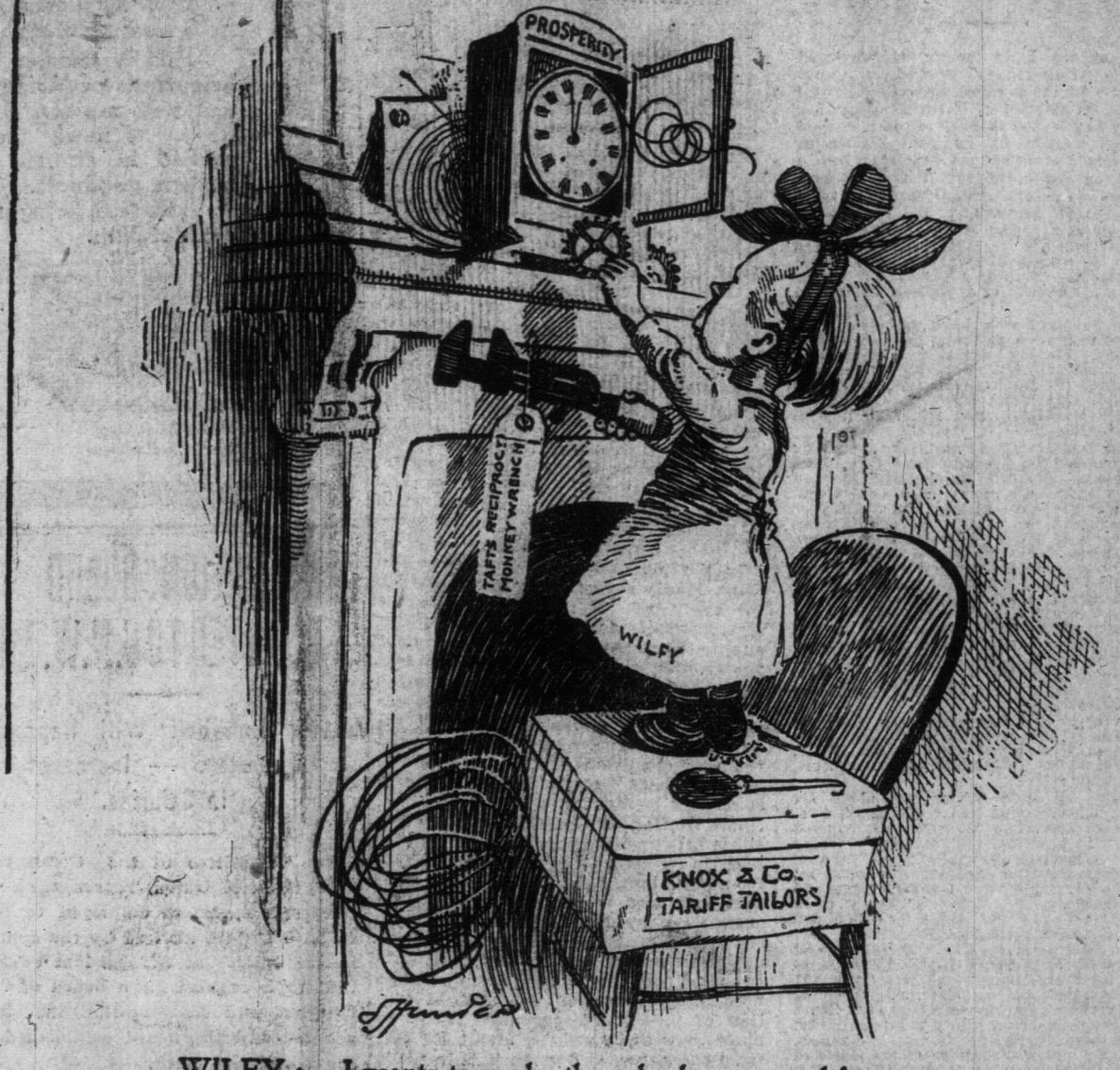
WILFY: I wants to make the wheels go round faster.