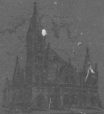
FIRST METHODIST CHURCH.