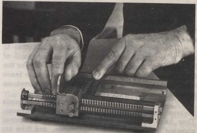
Blind programmer uses the new reader to scan a punched card in a matter of seconds.

With this device, the card is held in a base-plate and a carriage is moved manually along a track attached to the base. The edge of the plate carries a raised scale calibrated in Braille numbers from 0 to 80 to indicate the carriage's position in relation to the card. The carriage has a row of 12 pins which are normally flush with its top surface and a second Braille scale indicates the pin number.