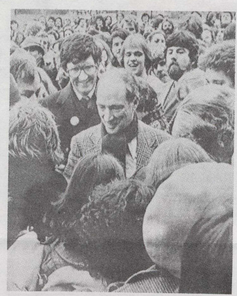
Liberal leader Pierre Trudeau meets students at the University of Western Ontario in London, Ontario.

While a minority government's hold on power is tenuous, this does not necessarily result in parliamentary paralysis. Minority governments are considered by some to be more responsive to the public and productive in terms of effective legislative programs. Canada's universal medical care program (Medicare), the winter works program and the Canada Pension Plan were introduced under minority governments.