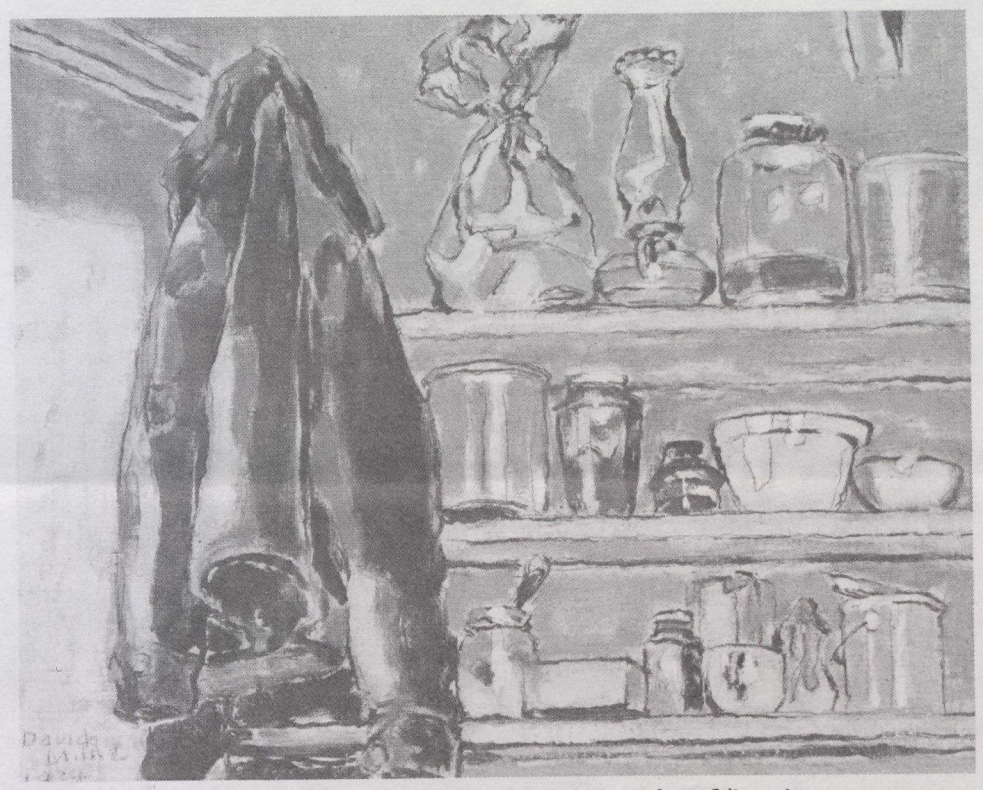
Cabin Shelf by David Milne was purchased with assistance from Wintario.

The whole basis of the Wintario grant system is that it acts as a stimulus to fundraising for a number of cultural agencies. In the case of the Art Gallery of Ontario the agreement is that Wintario will match, dollar-for-dollar, any money the gallery raises from the private sector which is