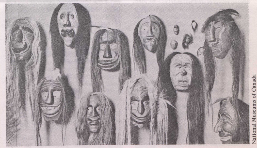
Masks reflect culture of native Canadians.

During meetings with Niger officials in Niamey, Martial Asselin, Minister responsible for CIDA, said the Canadian Government will assist in Niger's road construction programs to open up the landlocked country. In addition, he announced that Canada would double its aid contribution to Niger by participating in the construction of a major section of the Pan-African Telecommunications Network. Senator Asselin also pointed out that drought in the Sahel countries over the last few years has prompted Canada to support the efforts of these countries to become self-sufficient in food.