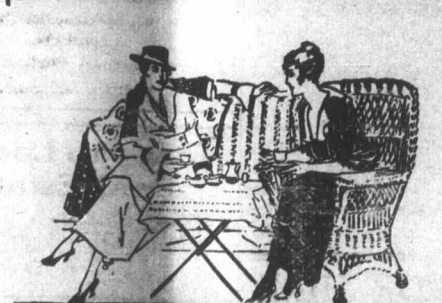
You see I had only a few thousand dollars left