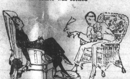
my brother borrowed some to help him along; of course that went and then-