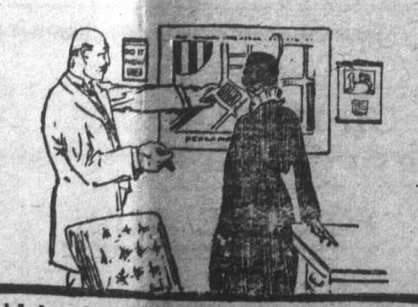
nd I thought it best to invest something in real estate at once. Well, that failed—