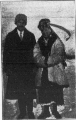
A BRIDAL PAIR

Prayer—That we may realize and perform our duty to the incoming