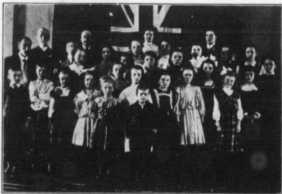
JUNIOR LEAGUE OF VALLEYFIELD, QUE.

*** The Juniors of Montreal City held a rally last Thanksgiving Day. When the roll was called each Society responded with fruit vegetables, or groceries, placing them along the platform as a thank-offering, to be distributed by the Deaconesses and Bible-women to deserving