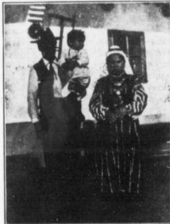
RUSSIAN PARENTS AND CHILD

What is our church doing for these thousands of needy at our own doors? The Woman's Missionary Society has two