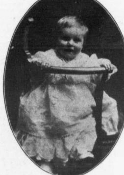
"FORBID THEM NOT"

At the present time they are studying three different books, "The Pilgrim's Progress," "Dr. Grenville Parish," and "Wild Animals I have Known." Besides this, the "Missionary Trip Around the World" is to be taken. The children do the talking themselves, being developed in many ways, rather than have the Superinten-