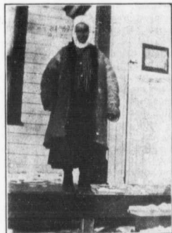
AN EIGHTY-YEAR-OLD GRANDMOTHER

minister to the needs of soul and body, to superintend the hospital, to oversee the work of the probationers in charge of Canadian work, to attempt what a half-dozen might be unable to accomplish. How small how pitifully small this seems in the face of the existing problem! God speed the scores who turn their eyes toward China's millions! They are needed there, but are none called to serve among the foreigners of Canada, called to learn a strange tongue and minister to these hungry souls? "We cannot be good," some have said to us, "we fast, we pray, but our hearts are bad, we cannot see God," for the yearning of the heart is wiser than the word of the