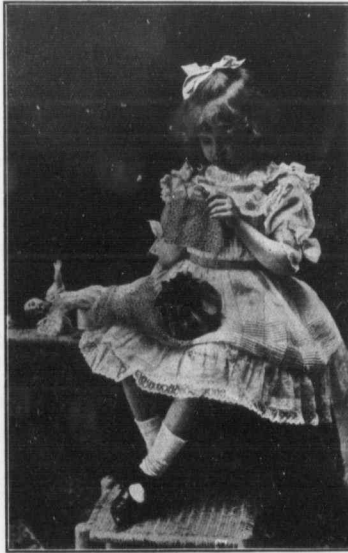
AN AMATEUR "MODIST"

In some ways one cannot help admiring the cleverness of the people who planned this pump; but they were a selfish lot, and do not deserve any praise. Fancy pretending you want to be kind to others, and making this an excuse for getting out of them much more than you give! Do you ever behave at all