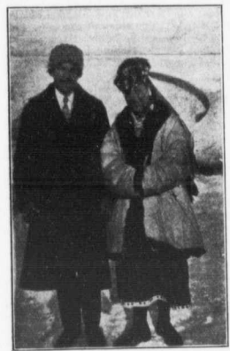
A BRIDAL PAIR

Hymn 322. Prayer—That we may realize and per-form our duty to the incoming