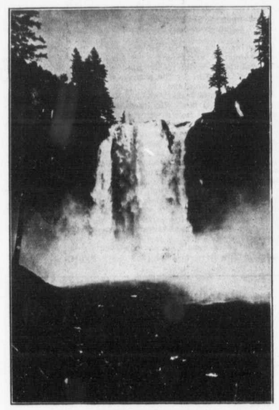
SNOOUALMIE FALLS

When Seattle was selected as the city in which to hold the Eighth International Epworth League Convention, there was