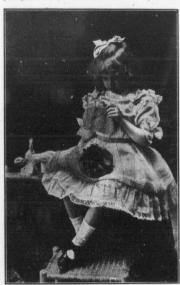
AN AMATEUR "MODISTE"

In some ways one cannot help admir-ing the cleverness of the people who planned this pump; but they were a elfish lot, and do not deserve any praise. Fancy pretending you want to be kind to others, and making this an excuse for getting out of them much more than you give! Do you ever behave at all