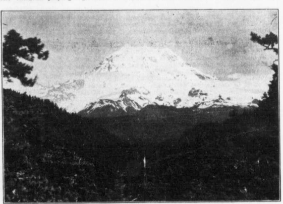
MOUNT RAINIER

God has a particular place for each plant. We see Divine wisdom displayed in the growth of all our flowers. Because the rose will live and thrive only in a warm temperature, we find it blooming in the warm months of the year, while the little hepaticas and snowdrops may be found blossoming almost before the ice has melted. Plants which reach their greatest luxuriance in warm countries will not thrive if taken