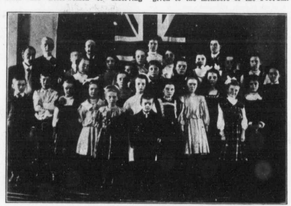
JUNIOR LEAGUE OF VALLEYFIELD, QUE.

There is a little country church called Bethel, away down on the Wooler Circuit, in connection with which there is a flourishing Junior League. In order to gladden the heart of the new Editor of the Era, the members decided to obtain some new subscriptions and renewals for his helpful paper, and besides appointed a "reporter" who is to send news items to the editor from time to time. The first item of interest has reached the Central office telling of an "At Homes given to the members of the Football