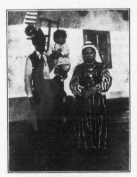
RUSSIAN PARENTS AND CHILD

What is our church doing for these thousands of needy at our own doors? The Woman's Missionary Society has two