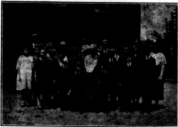
THE WALKERVILLE BAND, THE THIRD IN THE HONOR LIST FOR 1922-23