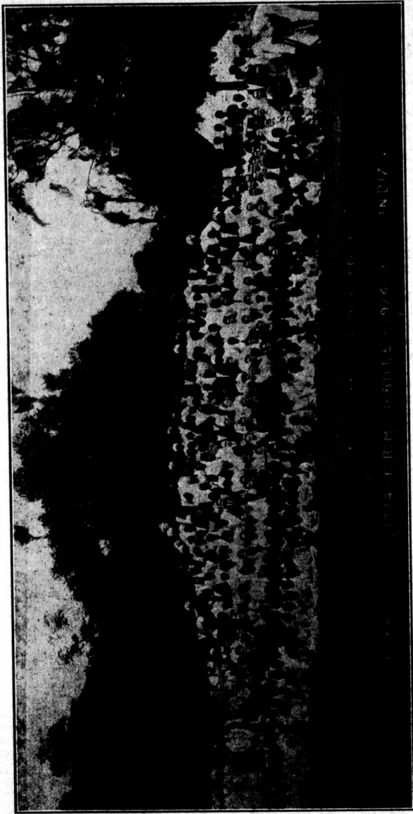
Missionaries and Native Christians at the Jubilee Celebration in Cocanada