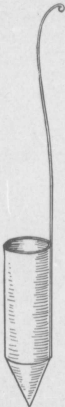
A CREAM DIPPER.