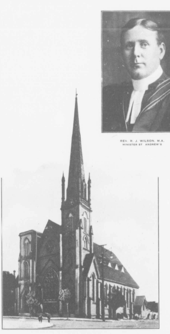
ST. ANDREW'S PRESBYTERIAN CHURCH TO-DAY