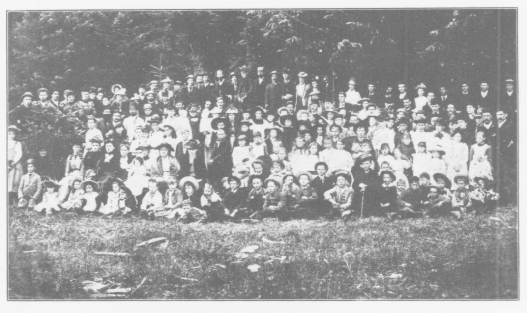
SUNDAY SCHOOL PICNIC AT JERICHO IN 1891