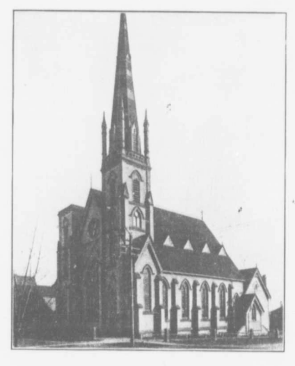
ST. ANDREW'S PRESBYTERIAN CHURCH SHOWING ORIGINAL BUILDING IN REAR USED AS CHURCH TILL 1890 AND AFTERWARDS AS SUNDAY SCHOOL ROOM