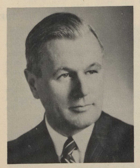
L. DANA WILGRESS Canadian Minister to Switzerland In the voting for chairman of the

For the first time, no member of the Soviet bloc was elected to the chairmanship of any of the six main committees. Representatives of the U.S.S.R. and Poland were however elected vice-presidents. The six main committees are composed of representatives of all member states of the Unit-