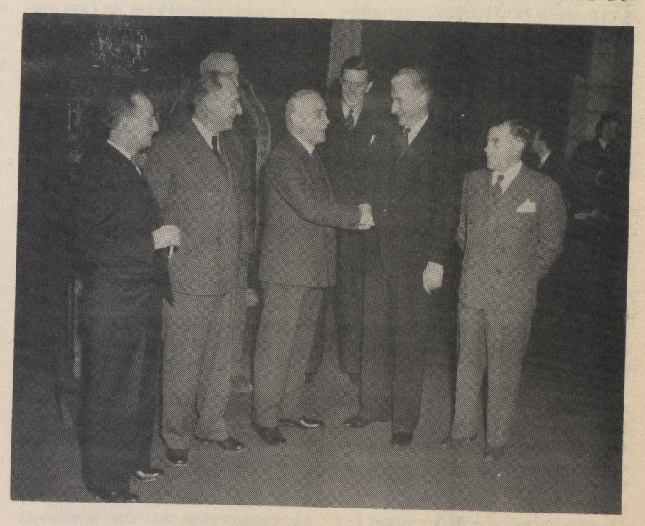
THE NEWFOUNDLAND DELEGATION

dream and did what they could to see it realized. These men are honoured by Canadians as two of the Fathers of Confederation. Again there was the conference of 1895 that ended in a second unsuccessful at-