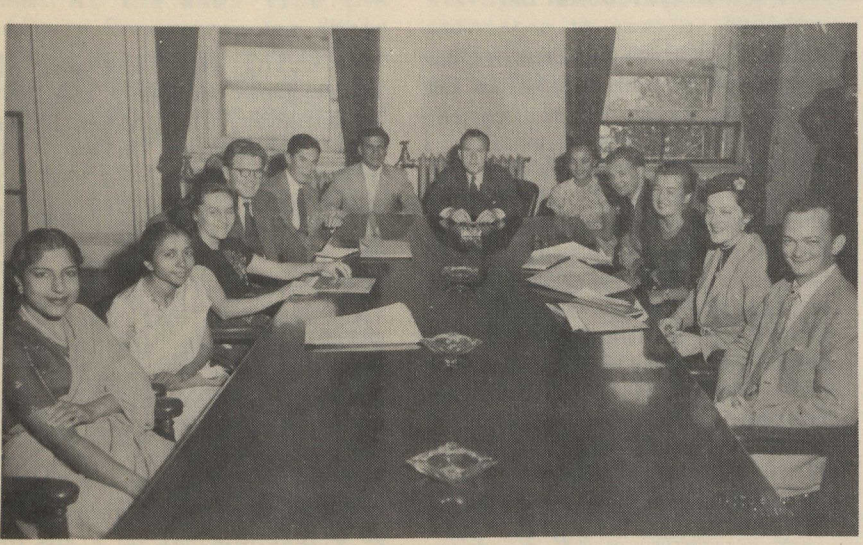
UNITED NATIONS INTERNES

Each of the specific questions which arises is neither purely economic, nor purely military nor purely strategic. In making decisions on any one