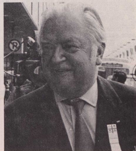
"The closing ceremony was magnificent," said IOC President Lord Killanin (above) "and I'm sure all who came to Montreal went home happy. The atmosphere has been great...all our problems have been well worth it."

EXTERNAL AFFAIRS AFFAIRES EXTERIEURES OTTAWA AUG 23 1976 LIBRARY / BIBLIOTHEQUE