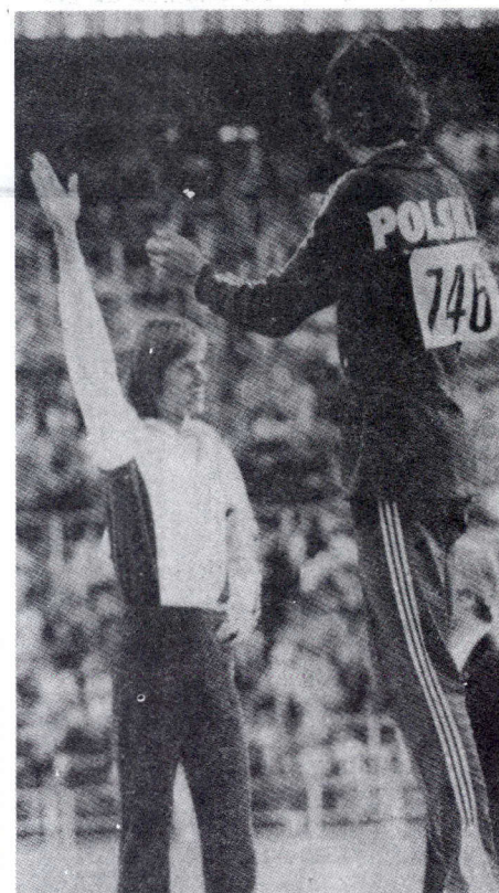
Jacek Wszola, Polish winner of the high jump, applauds Canada's Greg Joy, who came second.

Joy received the loudest and longest cheer of any Canadian at the Games. When he was awarded Canada's eleventh Olympic medal, he received a two-minute standing ovation.