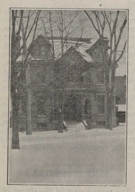
A New Social Club Building for Ottawa.

One of the principal handicaps under which the Civil Service Club of Ottawa has laboured has been the