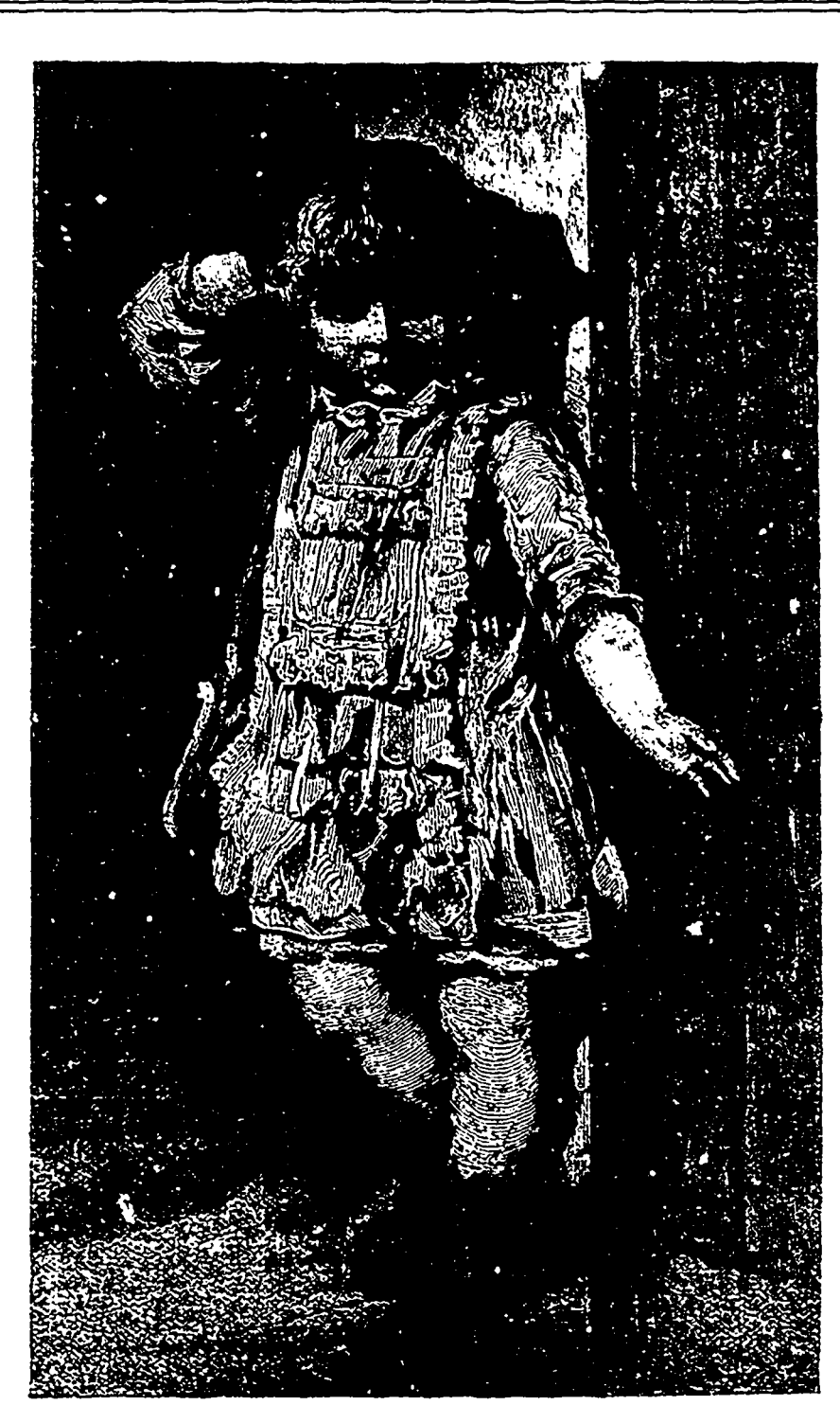
IN THE CORNER.

"Yes, I remember that; but what has that to do with toothpicks?"