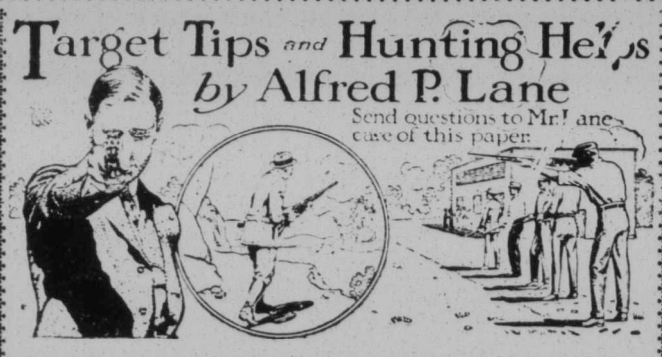
A New Questions and Answers Depart= ment of Interest to Shooters

offering their lives. This is a time mighty, important contest, as the tered now, the fragments would soon ambitious programme that Germany be gobbled up by the greedy foe, and your hair. Is not a dye