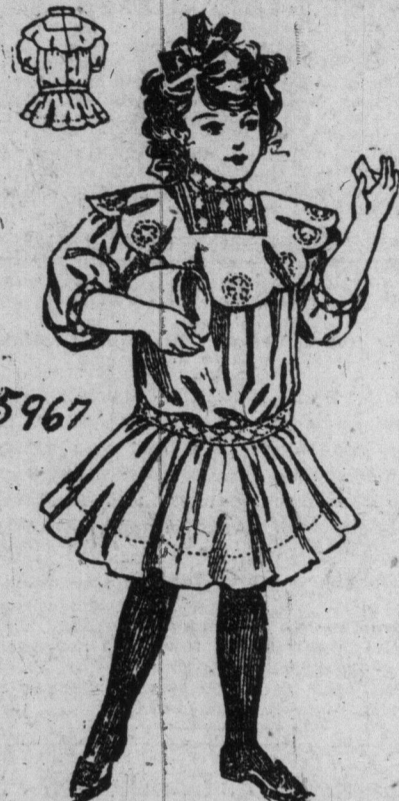
A Pretty Dress for a Little Girl.

Editor World: In view of the probable distress in the city this winter, and believing to help themselves, the Local Council of Women of Toronto, with the hearty co-operation of the Trades and the other organizations of the kind, have decided to open a bureau for women workers.