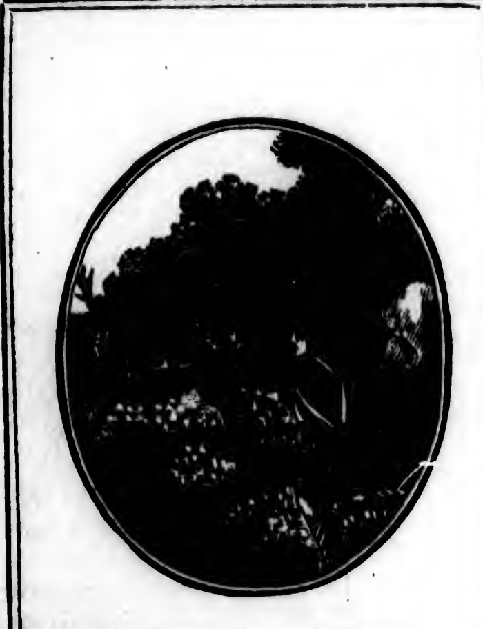
The Highlander in the Forest.