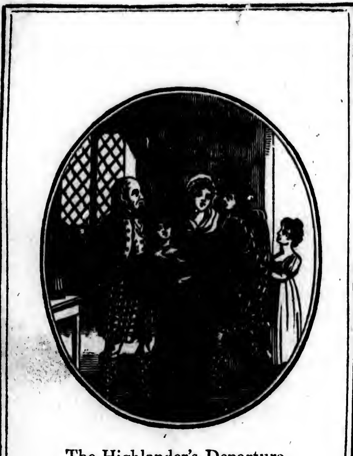
The Highlander's Departure.

lute me sol bed thi en CO he his an da the m m