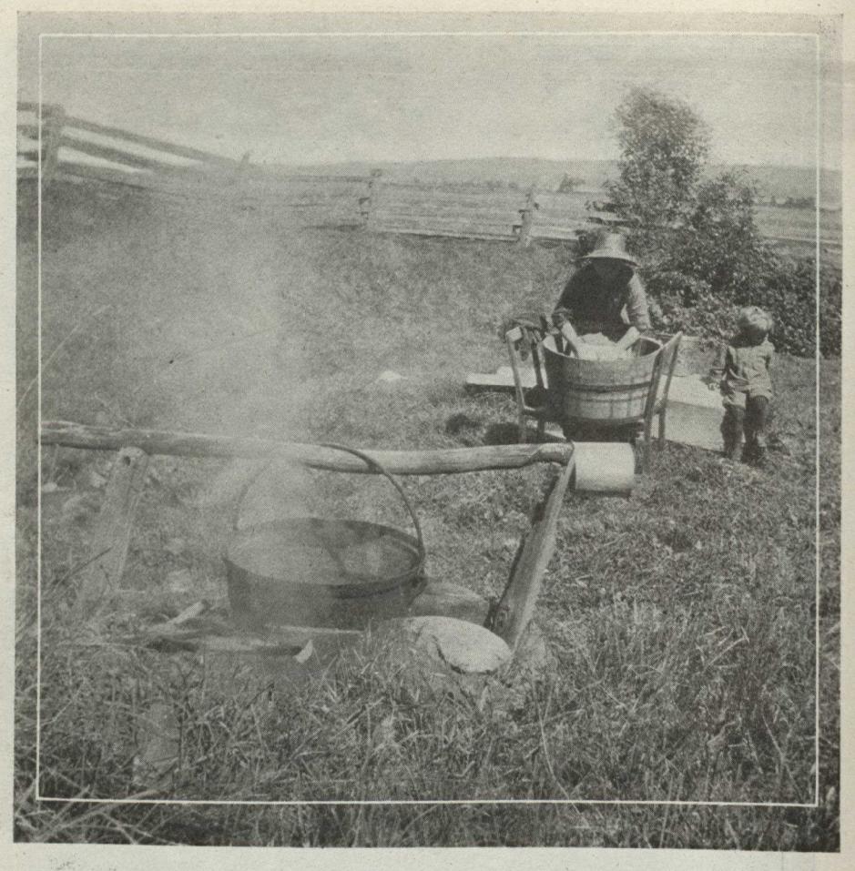
A real old-timer

wood into the bright and cheery bonfire under the pot that with the strange faculty of inanimate things often takes on a look of enjoying it all as much as the children. Thus wash-day or soap-making day becomes to these eastern households a sort of pienic. Many hands make light work, and madame of the grande famille of sixteen or eighteen children accomplishes her wash of seventy-five to a hundred pieces with signal ease and entirely without complaint through the pot's assistance—the pot that hangs under the blue skies above the glowing coals—the out-of-door pot that magnetizes the willing hands of natural children.