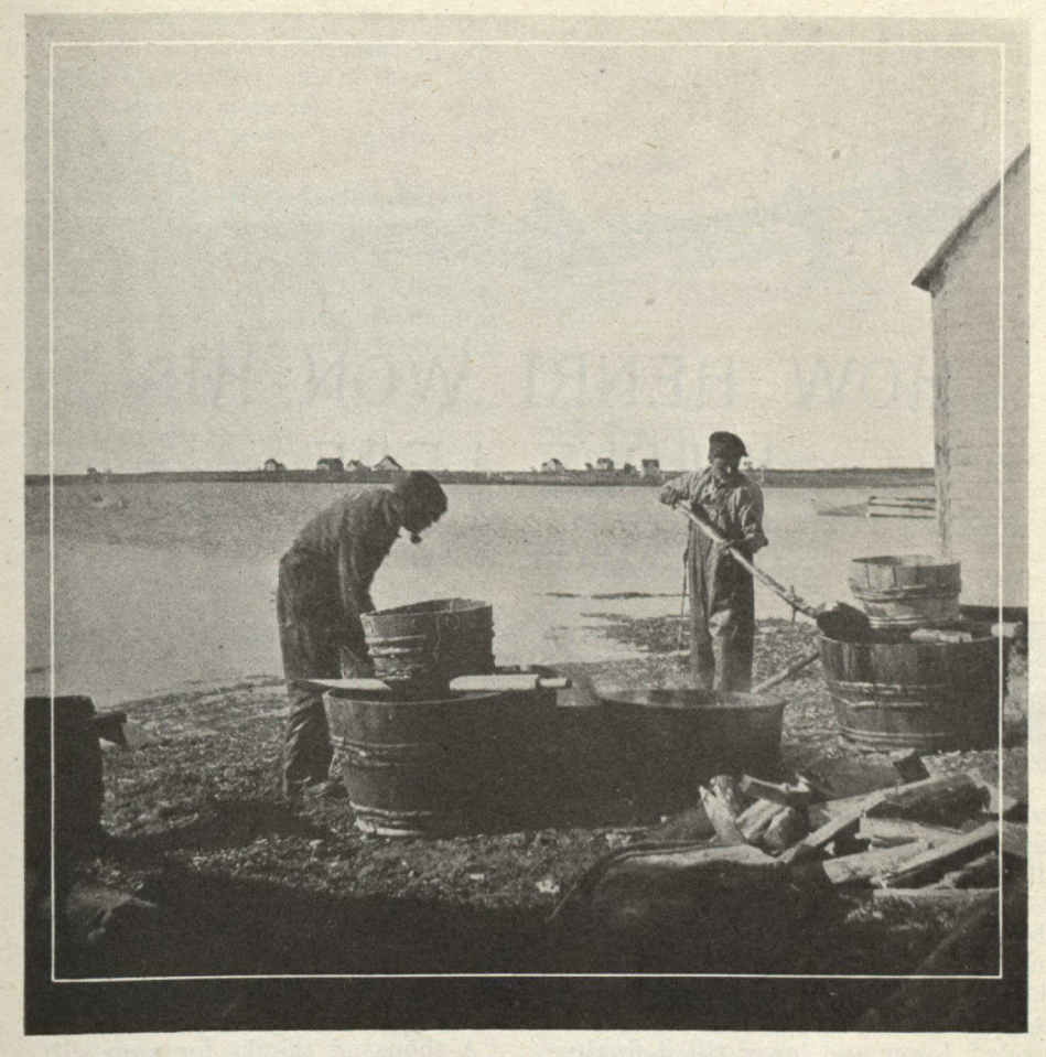
Boiling seal oil, Magdalen Islands

pot on the beach-stones to dry is a common sight on any fishing-beach of our Maritime Provinces.