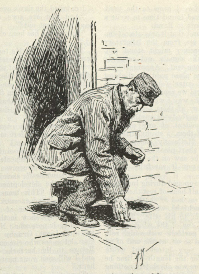
"McCready stooped and picked up a short piece of fine copper wire"

Not a soul was in sight, but it seemed to me that the shadow in a little niche of a building forty paces away was a little blacker than it should have been and I walked toward it. When within twenty-five feet of it a lithe figure dashed out, ran at right angles to my track, and shot around the corner.