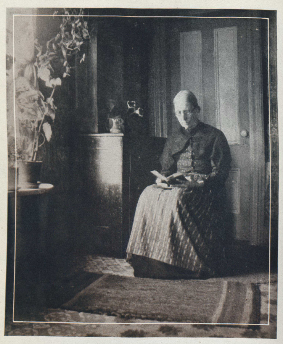
THE DAILY PORTION