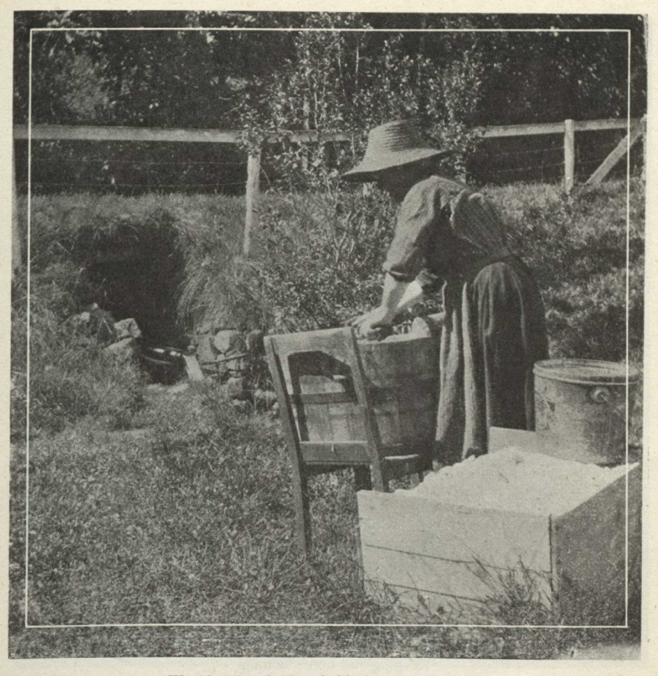
Washing by the brookside in rural Quebec

to the pot, which is a thing to remember. Our Canadian women are canny! And, the farther away from home the pot stands, the more of a picnic soapmaking day becomes for both mother and children. The ways of these wayside pots are past finding out to the casual man or woman driving these rural ribbon-roads of the Laurentides. unless this is remembered. For one pot may be so close to the road as to cause his horse to shy, while the next may be off in a field with no house in sight, and still another may be lost to sight down some stony river-gorge the ascending smoke alone telling the tale. But apart from the dve-pots and their sisters there is yet another