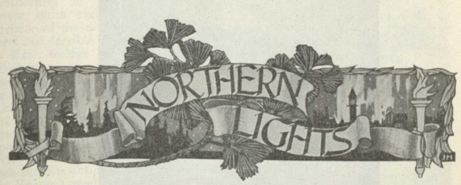
A DEPARTMENT OF PEOPLE AND AFFAIRS