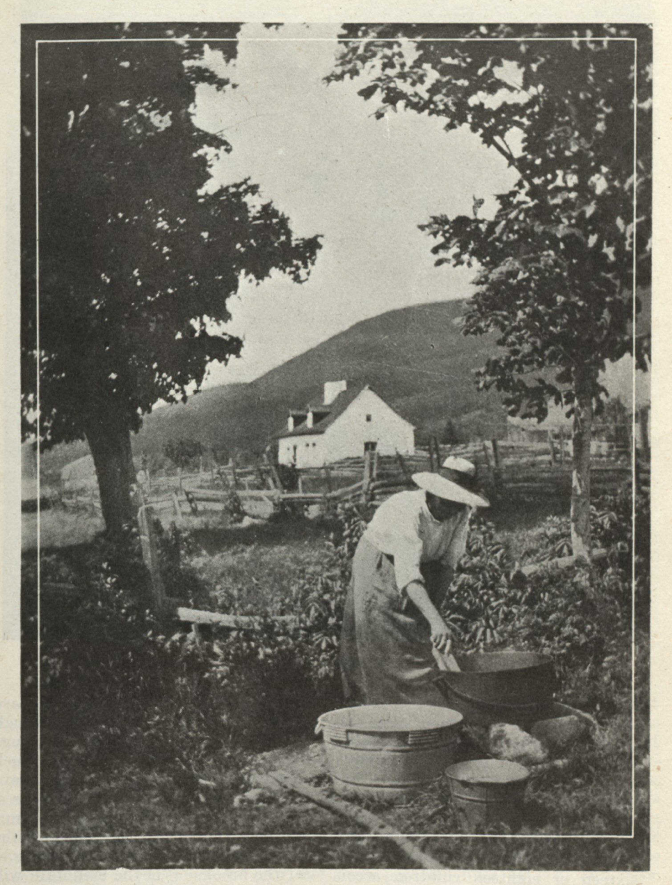
A typical French-Canadian rural scene

Canadian children what we are pleased to call work is the highest form of play. Every child and nearly all grown-ups love to build and keep going, a wood-fire out-of-doors. The great pots of Quebec and Nova Scotia give children an opportunity to serve