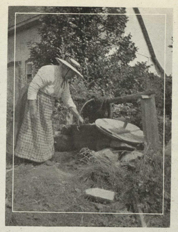
Dyeing wool, rural Quebec