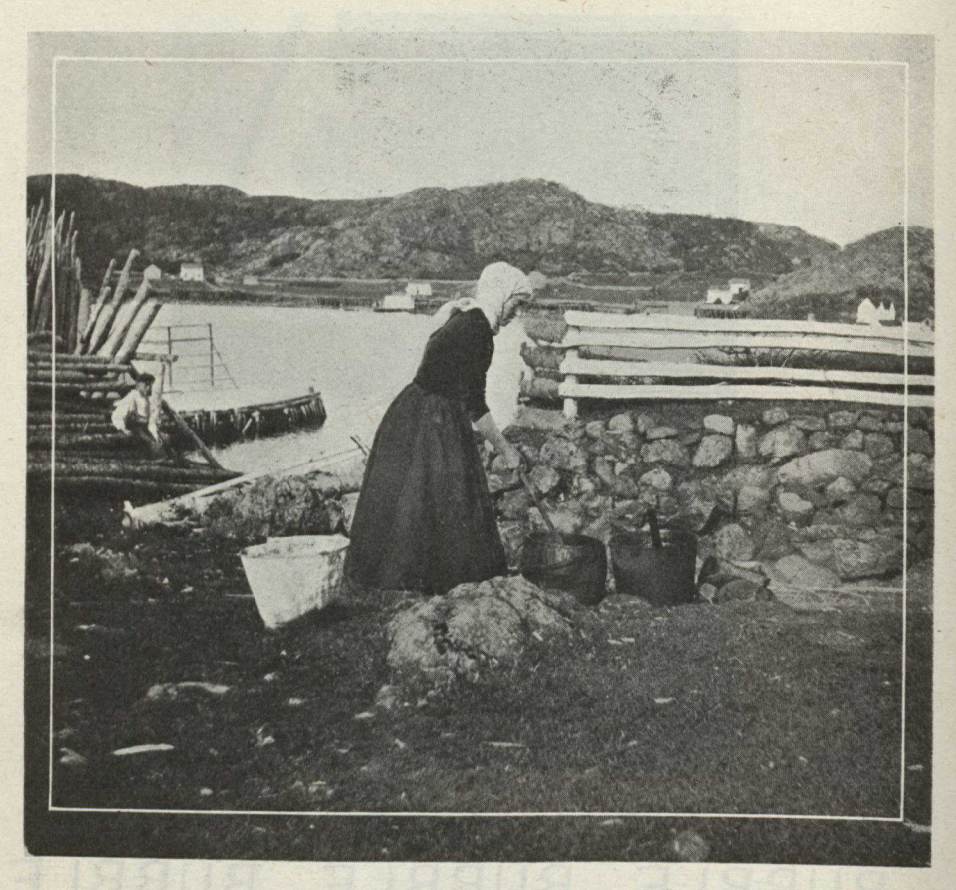
A familiar scene in eastern Canada

Even when you pass one of these out-of-door pots, whose fires are extinct until wash-day or dyeing day comes round again, one unconsciously feels at once through the pot's suggestion that in that little farm-house, over there by the barn, dwells a woman with initiative, some strong capable soul—some mother of invention—who turns every simple object at her command into a tool of service.