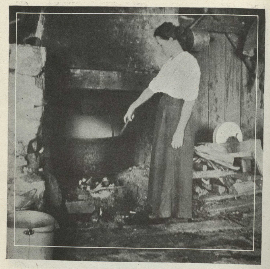
Keeping the kettle boiling

in their iron sides considerable power over our national industries and our national life.