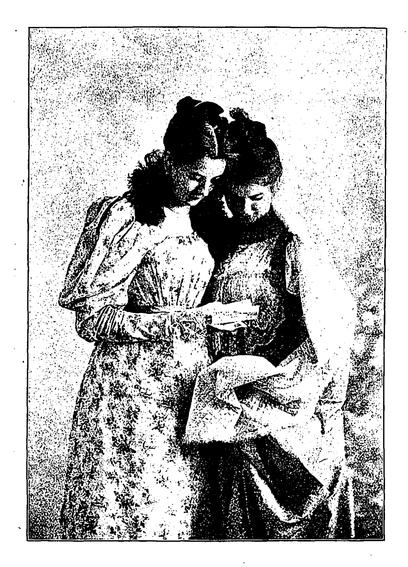
MADE WITH ANTHONY'S ELECTRIC LIGHT APPARATUS.