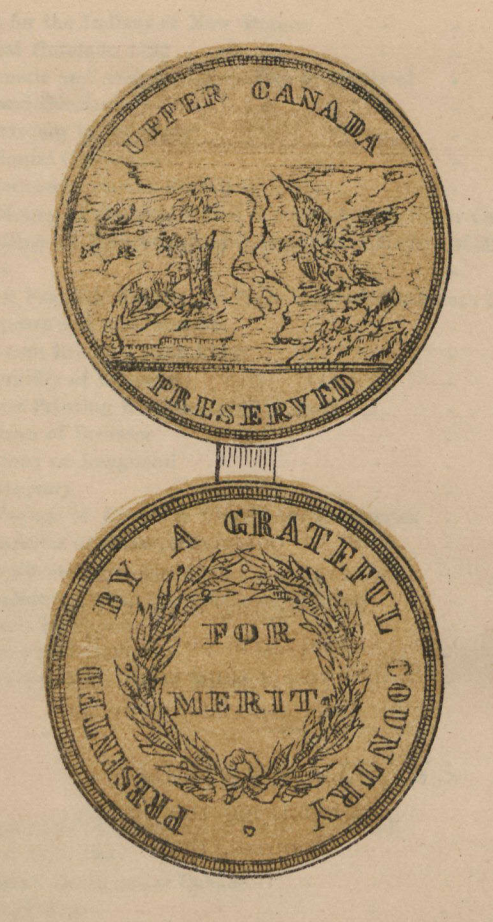
MEDAL OF THE LOYAL AND PATRIOTIC SOCIETY.