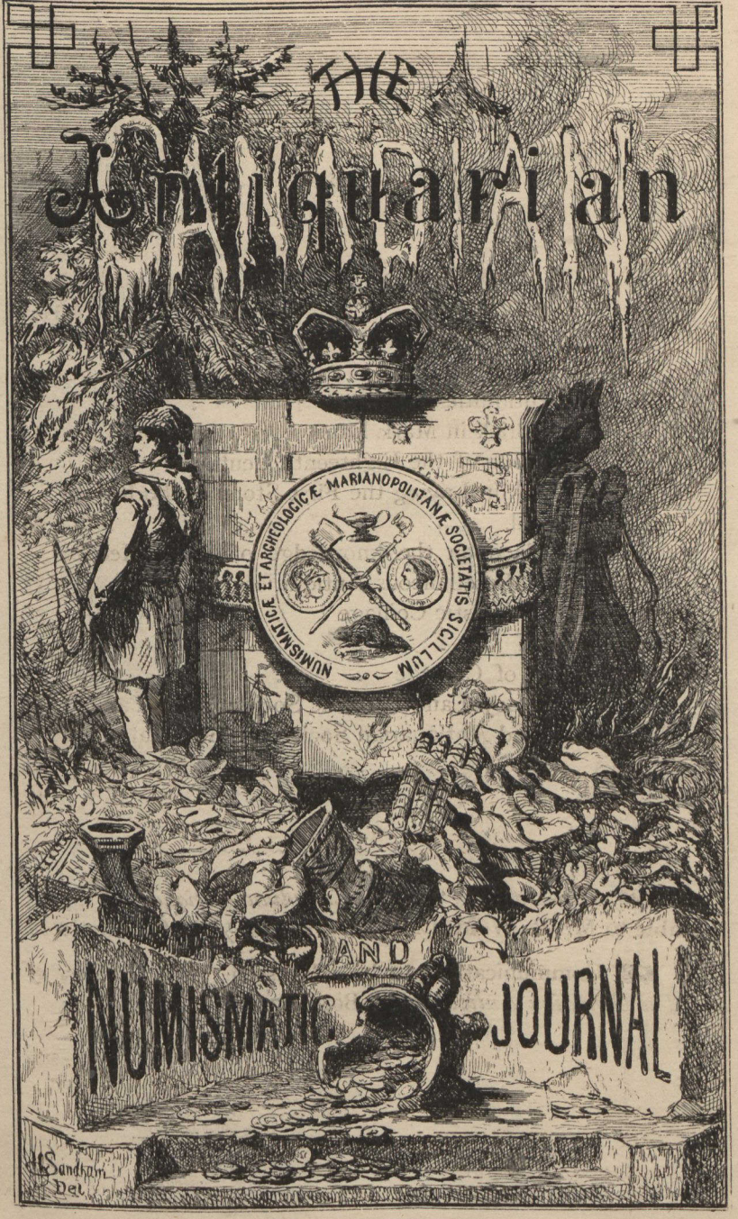
LEGGO & CO. STEAM LITH. MONTREAL