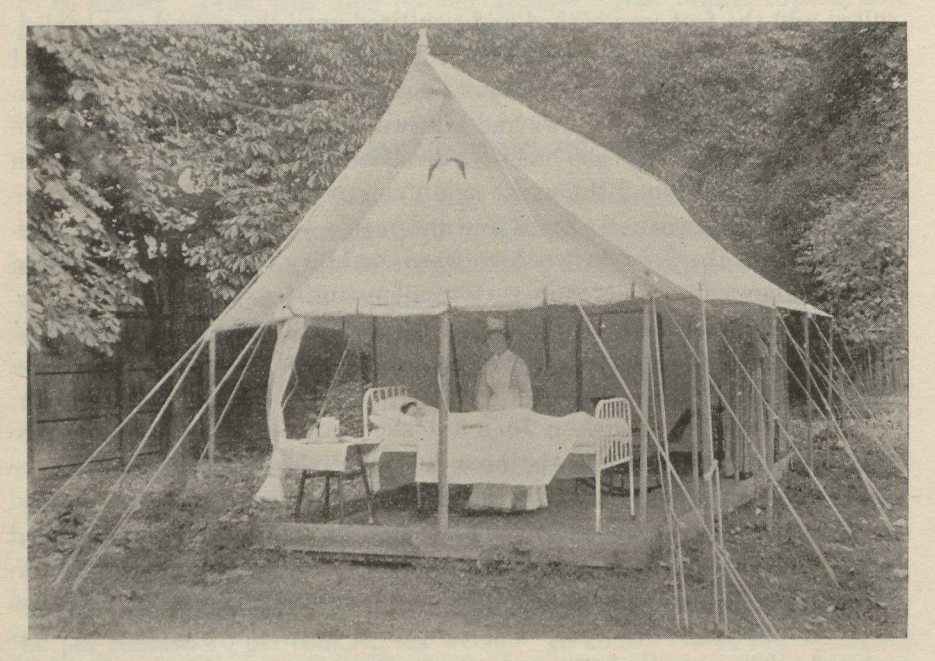
The Tent where patient was treated.

An especial point of interest in the case is the unusually long period of incubation, 21 days, from 5 to 10 or 12 days being the ordinary limits