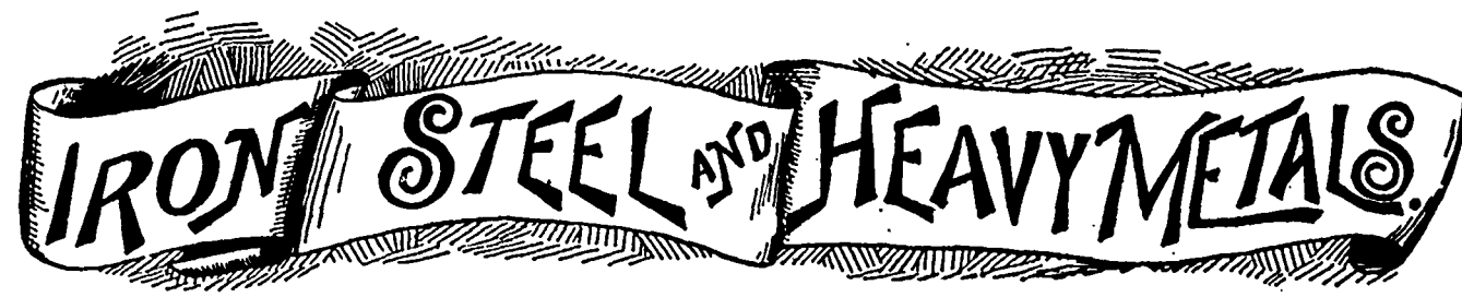
Iron and Steel.

Montreal, March 24th, 1891.—Notwithstanding the strong statistical position of the British pig iron market, the apparent firmness which displayed itself about the close of last month has given way to a general depression, and we have to report lower prices than have been current for some time past. Advices from Glasgow state that disgusted holders are selling out their warrants for pig iron, and rumors of financial troubles in London and discouraging reports about the general condition of the pig fron, and rumors of financial troubles in London and discouraging reports about the general condition of the trade are for the moment preventing any fresh buyers coming on. Scotch warrants, which were selling about 46s, at the beginning of the month, have touched as low as 43s. 4d., which is their present figure. It is evident, however, that any signs of even a partial revival of trade would bring about an immediate re-action, as stocks in Scotland are still being decreased at the rate of 4,000 to