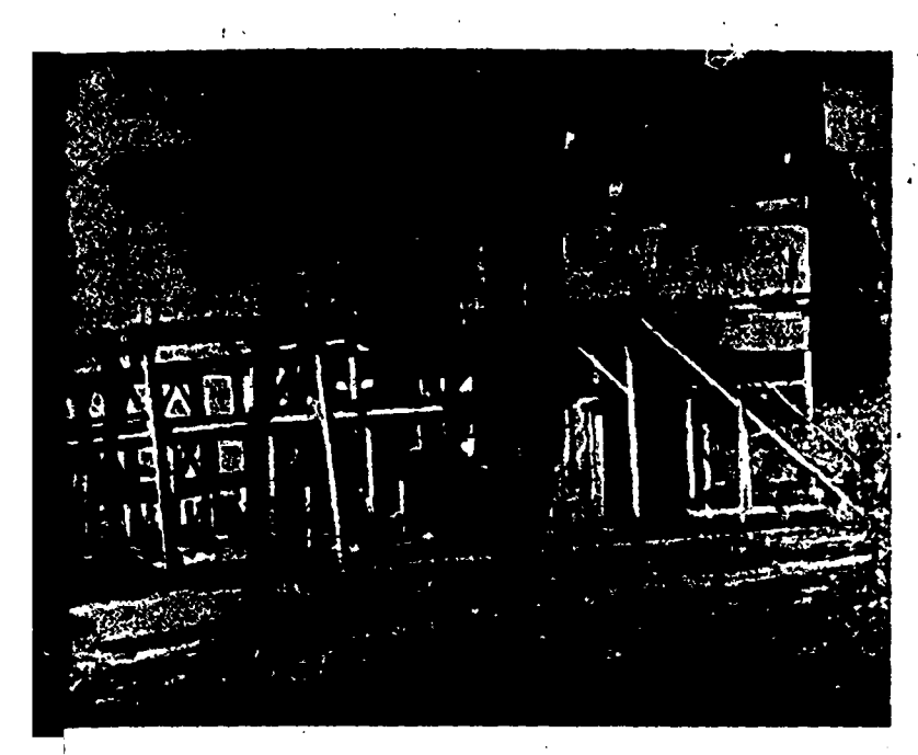
THE TOWN OF SPRINGHILL FROM THE COLLIERY.