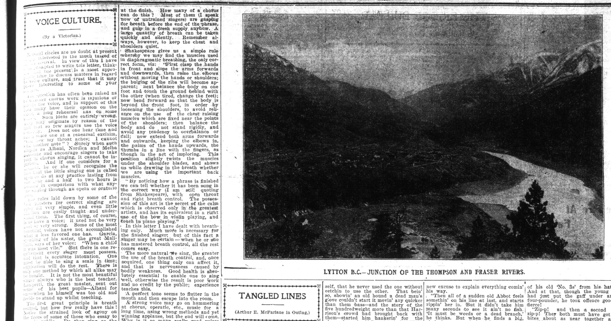
LYTTON B.C.-JUNCTION OF THE THOMPSON AND FRASER RIVERS.

MINING IN ATLIN, B.C. -"LUCKY BOY" CLAIM, SPRUCE CREEK.