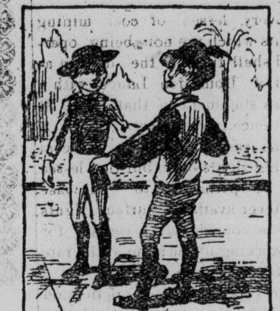
"WITH BELLS HUNG ROUND THEIR

The reunion was a happy one. There was no one like daddy, you know, and they had missed him sadly during his