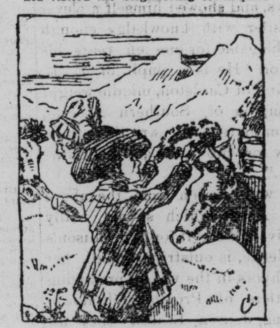
DECKING THEIR HEADS WITH WREATHS

have, and that is all." Sid visited the neighboring town quite