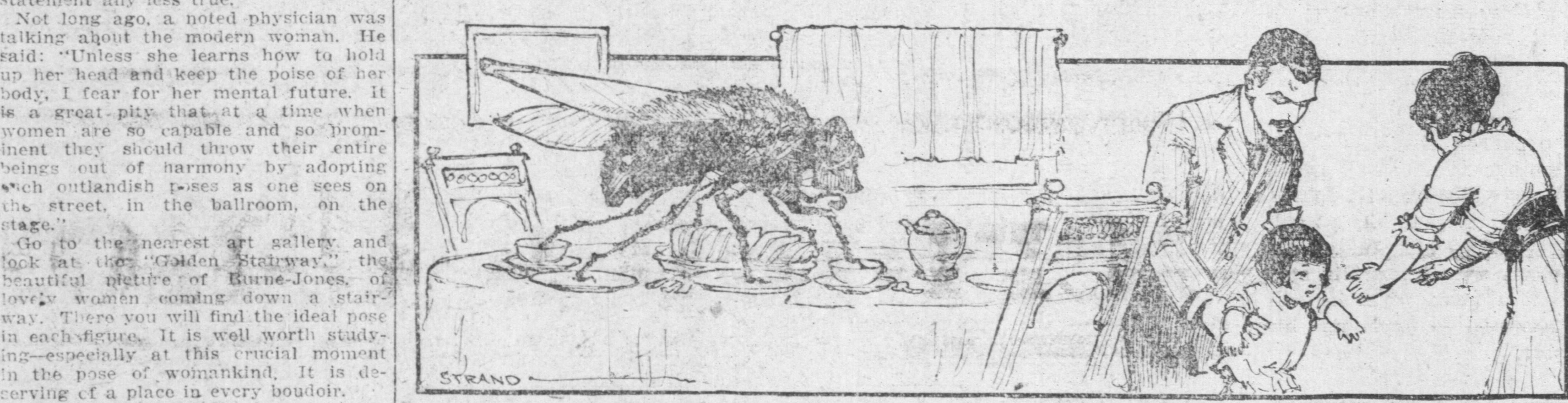
Every Fly in the Home Is a Harbinger of Evil.

well as animal ailments the disease winter noon, they will again find you out found in the dejecta, in the saliva, and on the feet of the common house fly. person. Measles, diphtheria, scarletina, Let us all go to the trouble of an- Epidemics of typhoid, dysentery and