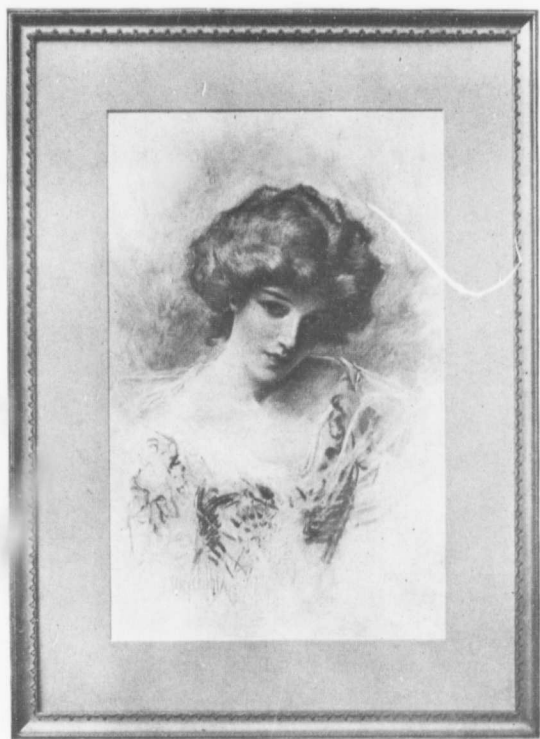
"'SHE IS JUST LIKE A PANSY—ALL VELVETY AND PURPLY AND GOLDY.'" (See page 16)