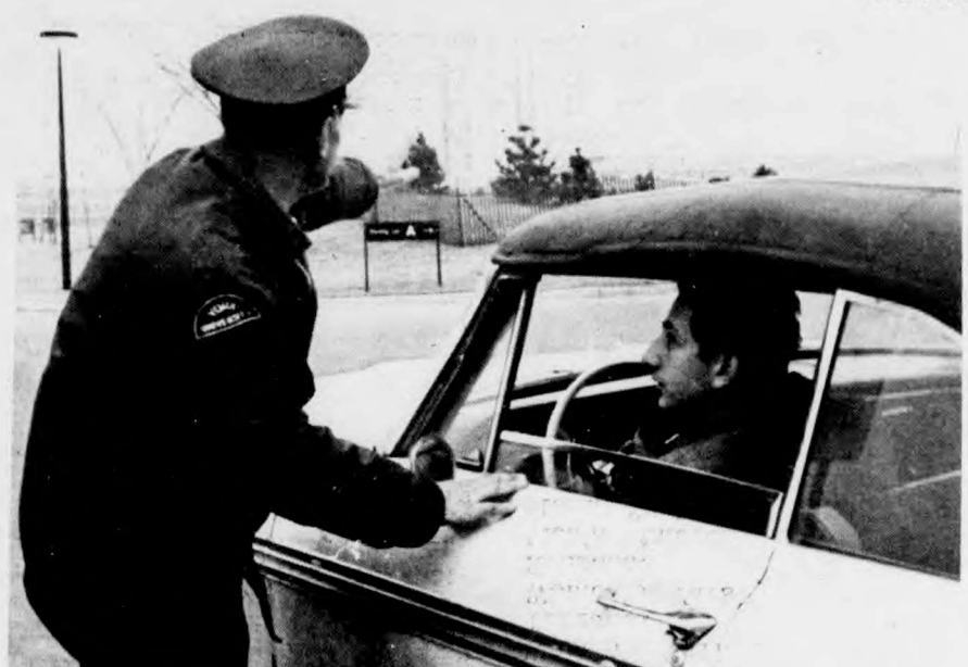
"And that big tall white building over there is the washrooms."