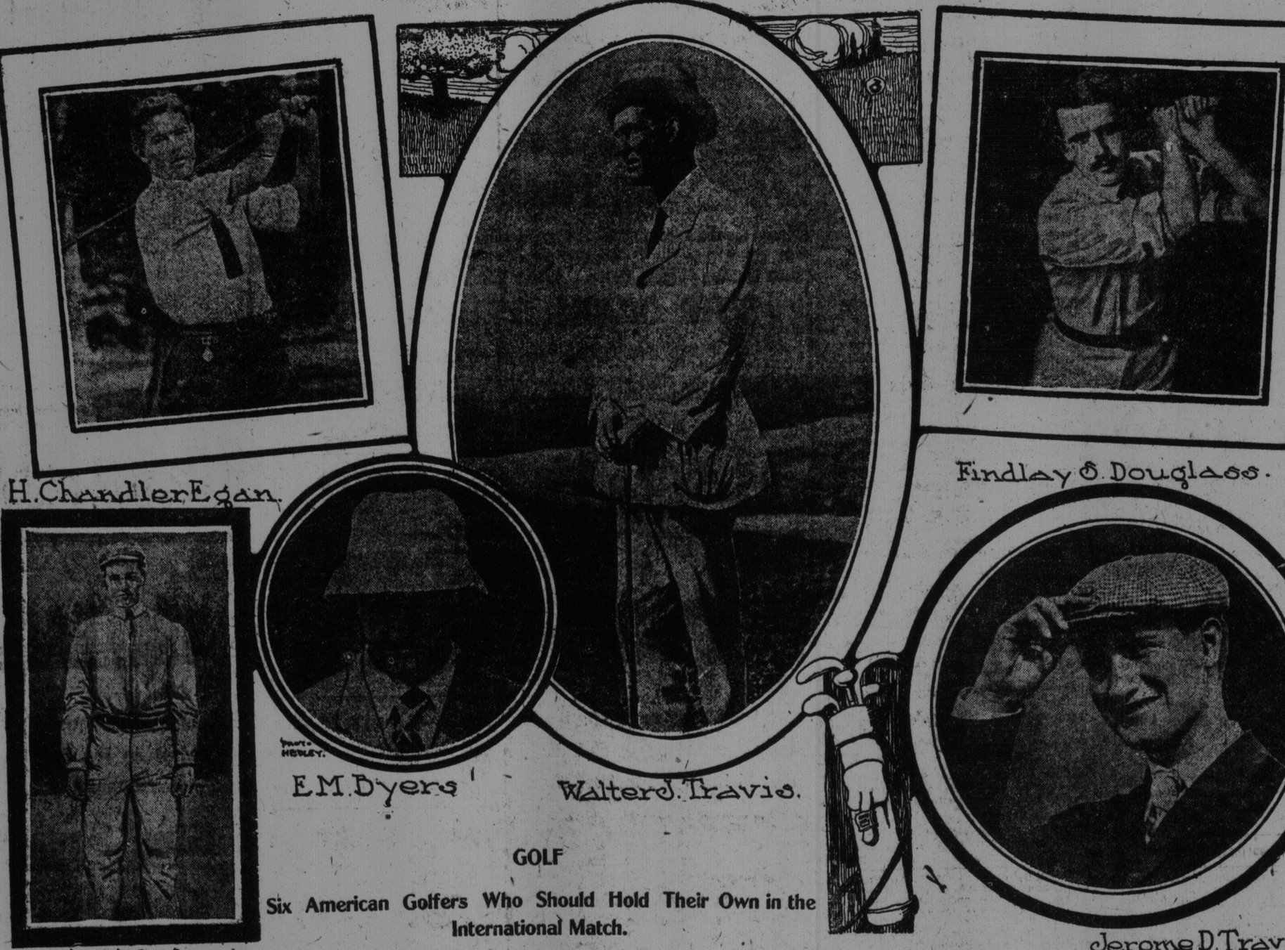
Six American Golfers Who Should Hold Their Own in the International Match.