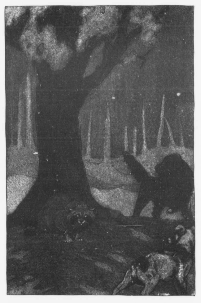
"BY THE TIME THE HUNTERS CAME UP THE MONGREL HAD DRAWN OFF."