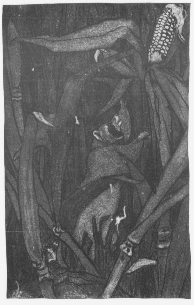
"THEY RAN RIOT . . . THROUGH THE TALL, WELL-ORDERED RANKS OF GREEN "