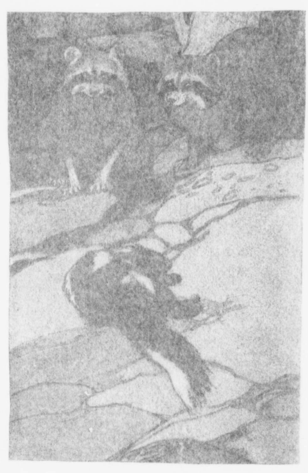
"THEY FOUND THE BODY OF THE SKUNK."