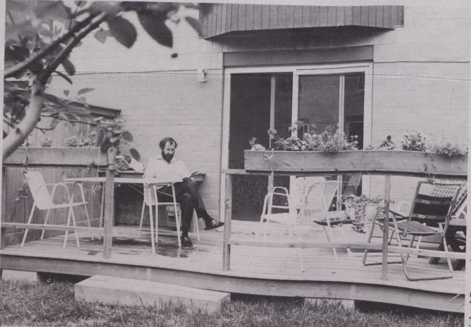
Three-bedroom townhouse in Woodsworth Co-operative has bright kitchen with bay window, compact back yard with spacious deck.