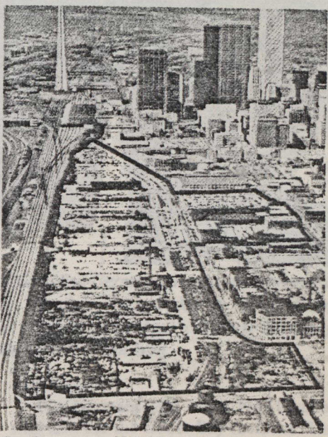
St. Lawrence Neighbourhood is outlined by black border.

Although St. Lawrence will eventually be a mixed public, private non-profit, and entrepreneurial development, a deliberate decision was made to have the non-profit organizations develop all this first phase. Thus it could be guaranteed that the first 25 per cent of these initial 799 units are eligible for deep rent sup-