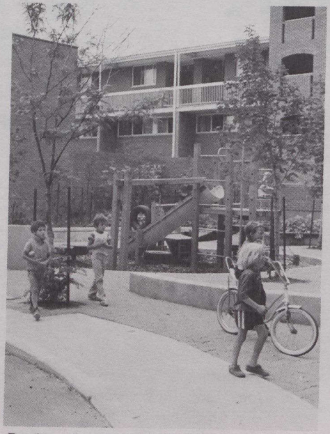
Pocket playground adjoins townhouses.

Experience showed that buildings with units on only one side of the corridors could successfully act as buffers. Consequently, two of the housing developments on the site. Cathedral Court and Cityhome's eight-storey apartment building, were deliberately designed for this