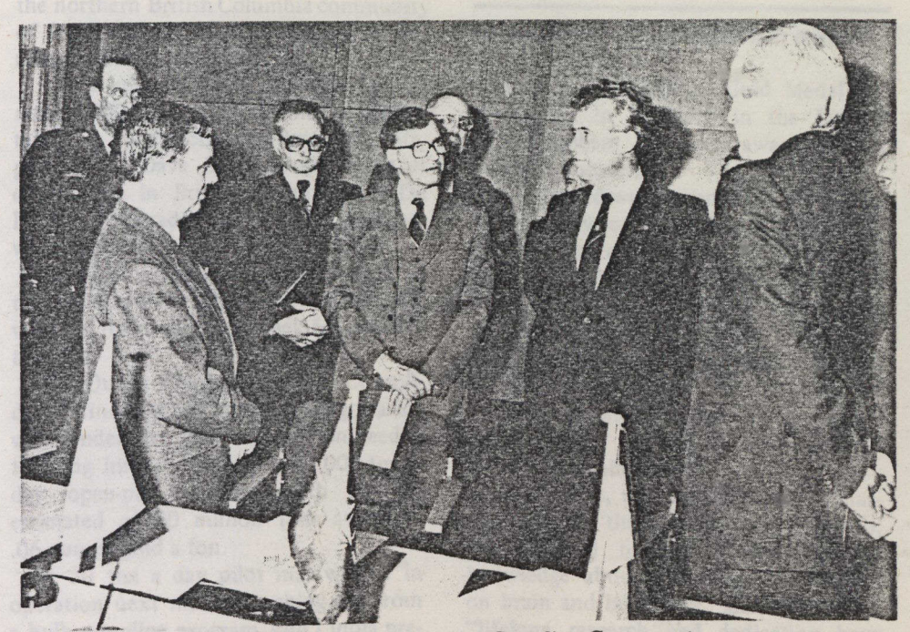
Defence Minister Gilles Lamontagne signs the Canadian-German air training agreement. Pictured at the signing are (left to right): Canada's Ambassador in Bonn Klaus Goldschlag, Mr. Lamontagne, German Defence Minister Hans Apel and State Secretary of the Foreign Ministry of the Federal Republic Guenther van Well.

The agreement reflects Canada's conlinuing resolve to help maintain the detertent capability of NATO forces. It will temain in effect until December 31, 1983. The agreement follows a successful trial period of flight training conducted by the German Air Force at Goose Bay from July to October 1980. Under the terms of the agreement, the Germans will station up to 200 personnel and 16 aircraft at