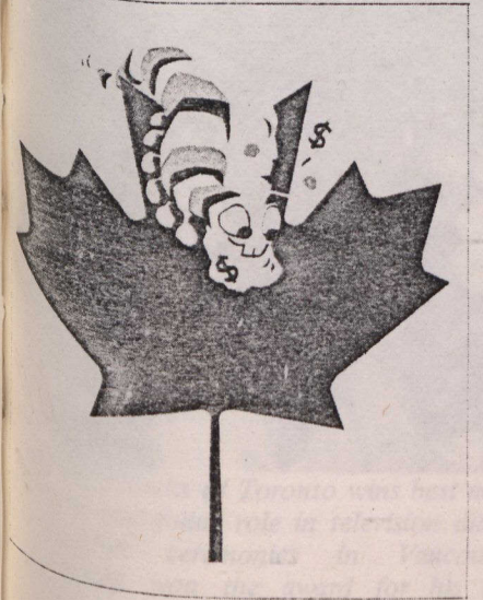
"Don't bring it back"

The program, with the theme "Don't being it back", emphasizes that many of animals arrived in Canada as "hitchhikers" and agricultural items as plants, seeds meat. These pests and diseases leave