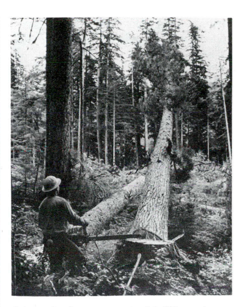
A tree in the process of falling after it has been cut by the logger

Household paper products are very commonly used. There are paper towels,