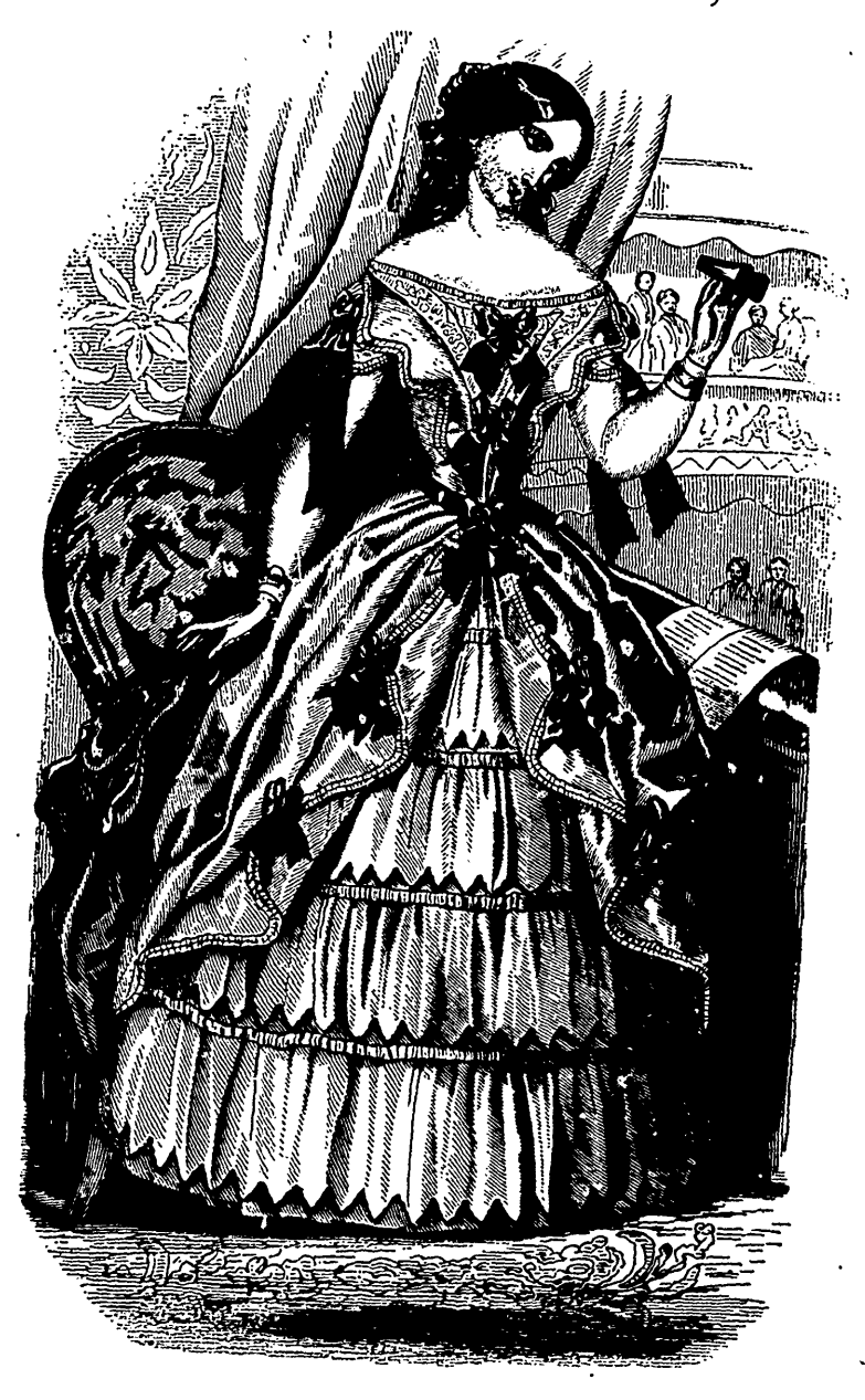
Paris Fashions for January.