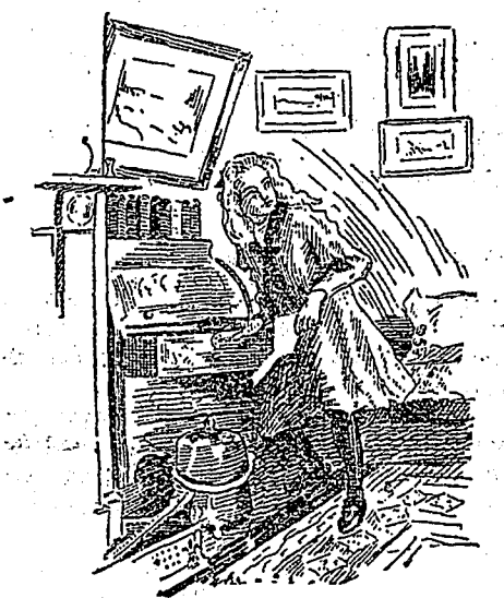
SHE UNLOCKED DRAWER AFTER DRAWER.

The parcel of books were lying on an ottoman by the window. Ella soon extracted two or three of the coveted crisp white covers; and then she went over to Mrs. Harwood's bureau and unlocked drawer after drawer in search of the five-pound note. But it was in the upper part, after