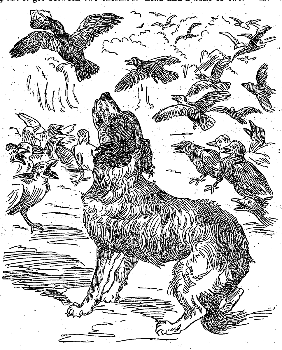
THE POOR DOG WAS DECEIVED BY THE BIRDS

The animals were very wary, and made to find a passage called the although they were short of food on board the ship, it was difficult to get near enough to shoot a deer or Often when they did shoot 'Investigator,' commanded by Cap- a deer, before they could get a sled to get it to the ship, the wolves As this ship entered the Arctic re- would have eaten all except the 'Half-a-