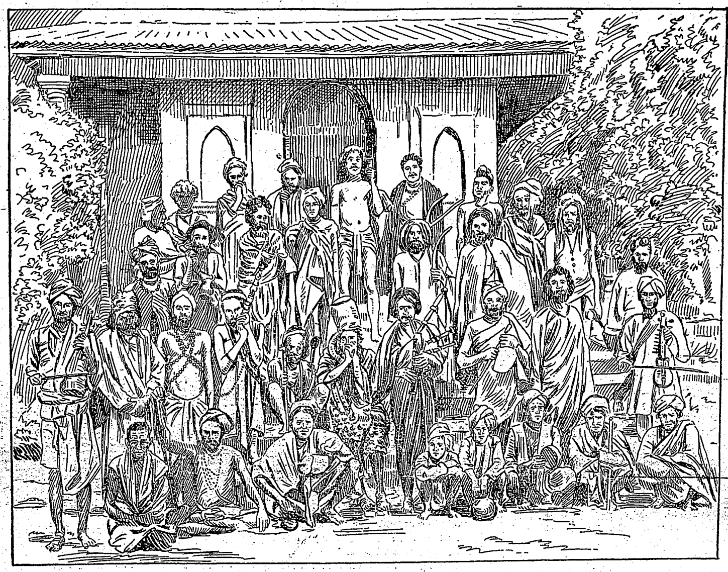
GROUP OF SADHUS AND WANDERING BEGCARS'