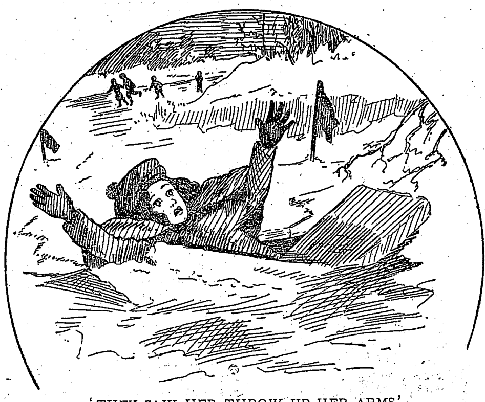
THEY SAW HER THROW UP HER ARMS.