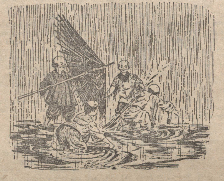
SOME OF THEM SLIPPED AND FELL, BUT THEY DID NOT MIND THAT.

It is very funny for us to look at, but I am sure you would not like to be the little boy or do as he has done. Do your work first and play after, and then you will enjoy it.