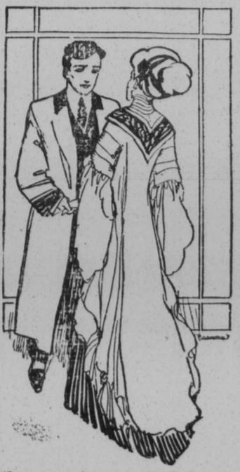
"I want you for my husband, dearest."

The voiture drove up before the historic old palace in the Boulevard St. Germain. Chase's heart was beating furiously as he stepped to the curb. The coacher leaned forward for instru-