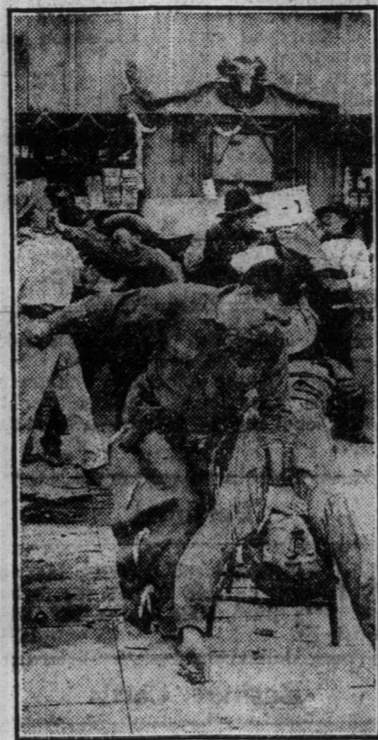
Others Still Fought at One Another's Throats.

Wonder what upset your stomach— which portion of the food did the damage—do you? Well, don't bother. If your stomach is in a riot; if sour, gassy and upset, and what you just ate has fermented into stubborn jumps; head dizzy and aches; belch gases and acids and eructate undigested food; breath foul, tongue coated; just take a little Paper's Diapensin and in five minutes you wonder what became of the indigestion and distress.