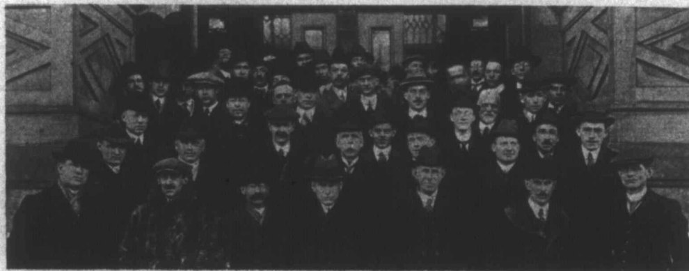
Some of the members of the Canadian Mining Institute at the Montreal Meeting, March 6th.