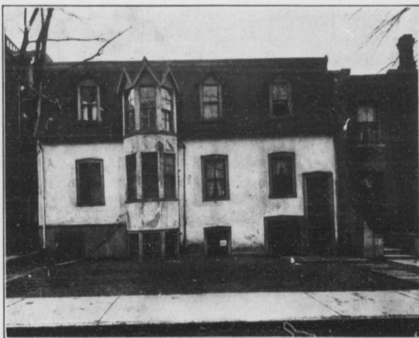
The houses shown in this picture are greatly overcrowded. In one of them 19 men sleep in three rooms—7 of them sleep in one room; another room is very small. The cellar is unsanitary and a place of filth. In another of these houses 13 people live in 5 rooms. External appearances are sometimes deceiving, as is manifest in this picture.

making in all 2,207. It is a serious matter that for the total of the above outside and inside 4,458, there are in these districts in all 5,382 families. The outside closets are of many different types: privy pits, box closets, drain closets, closets flushed by waste water from the sink, water closets