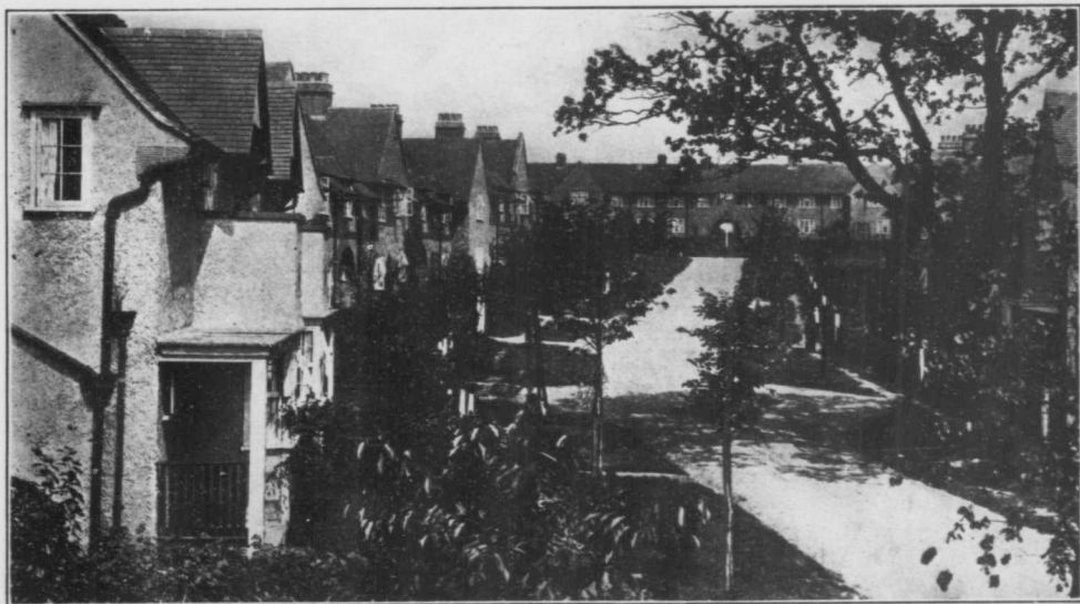
Asmunds Place, "Hampstead Tenants Limited," a street of houses at rentals from 6/- to 9/6 per week, built on the Co-partnership system; from Raymond Unwin's "Town Planning in Practice" (by permission)—Width of road or street, 71 ft. 9 in. The above cut represents beautiful houses that are being rented for less than the tenants were formerly paying for uninhabitable, filthy hovels in the slums, which is due, in a great measure, to the difference in land value.