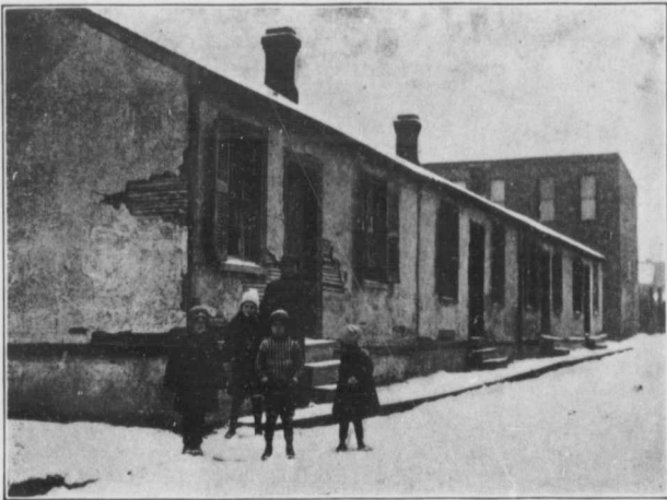
The house represented in this picture will not keep out either wind or rain, and is very much overcrowded.

Next comes the question of the outside privy pit; for people to be compelled, in an advanced age like this, where there is proper street drainage and sewers available, to use the outside privy pit, is a relic of barbarism which should no longer be tolerated. Landlords and tenants must avail themselves of these aids to proper sanitation. Where there is a sewage service and proper water supply, the outside privy pit must no longer be permitted to exist. In many places people are compelled to keep their windows closed on account of the offensive odors. These nuisances afford a fruitful medium for the conveyance of the disease-producing germs through the medium of the common house fly.