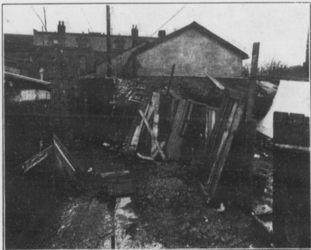
The above picture shows outside closets and backyards in a disgraceful condition.

grants live under conditions which threaten the sanitary welfare of the City. In some of the houses visited there were noticed several sewing machines, which points to a shadow of the sweat-shop. It is important that this matter should be handled at the earliest possible opportunity. General public feeling is against the inroads of anything of this character in our City, but unfortunately the public grow used to anything, and it is therefore imperative that the sweat shop be stopped in its inception.