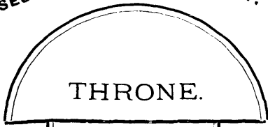
DIAGRAM OF THE SENATE CHAMBER. 4TH SESSION, 8TH PARLIAMENT, 1899.