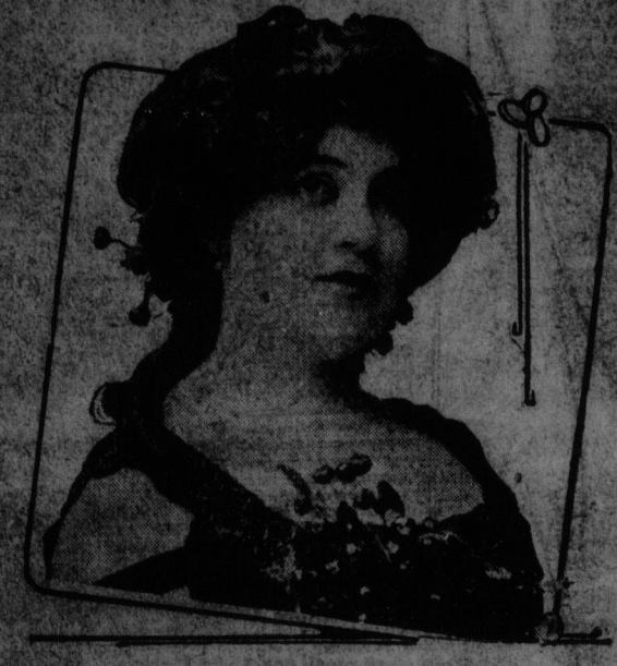
LAST PHOTGRAPH OF MURDERED WOMAN.

Clerk Who Stole $500,000 in Announcement Made Following Bonds From Russo-Chinese Bank Arrested In Restaurant -Sent To Tombs.