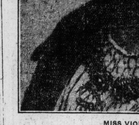
MISS VIOLA ALLEN.

The role of Imogen in which Miss Allen will appear is one of the bard's most wonderful feminine portraits, and is said to ideally suit the star's temperament and winning personality. Although the first recorded production of "Cymbeline" was made in 1833, and it was in the early part of the nineteenth century a favorite play with many English and American actresses, the women who have essayed the part of