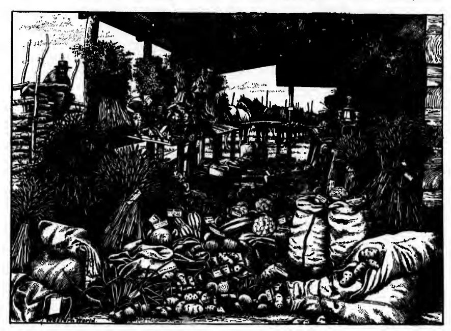
FARM PRODUCTS AT CARROT RIVER AGRICULTURAL SOCIETY'S EXHIBITION, 1892.

classes of persons who find their energies cramped and their prospects "cribbed, cabined and confined" in their own over-populated countries. To such men the writer would say: "Come to the North-West. Whether from the long settled provinces in this continent or from the mother land beyond the broad Atlantic or from the swarming hives of Europe, come to the North-West. You will find here elbow room, which is what you re-